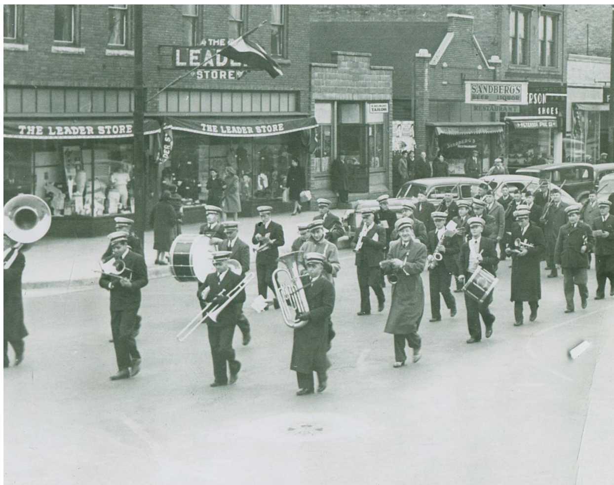
Escanaba City Band (Main Street)