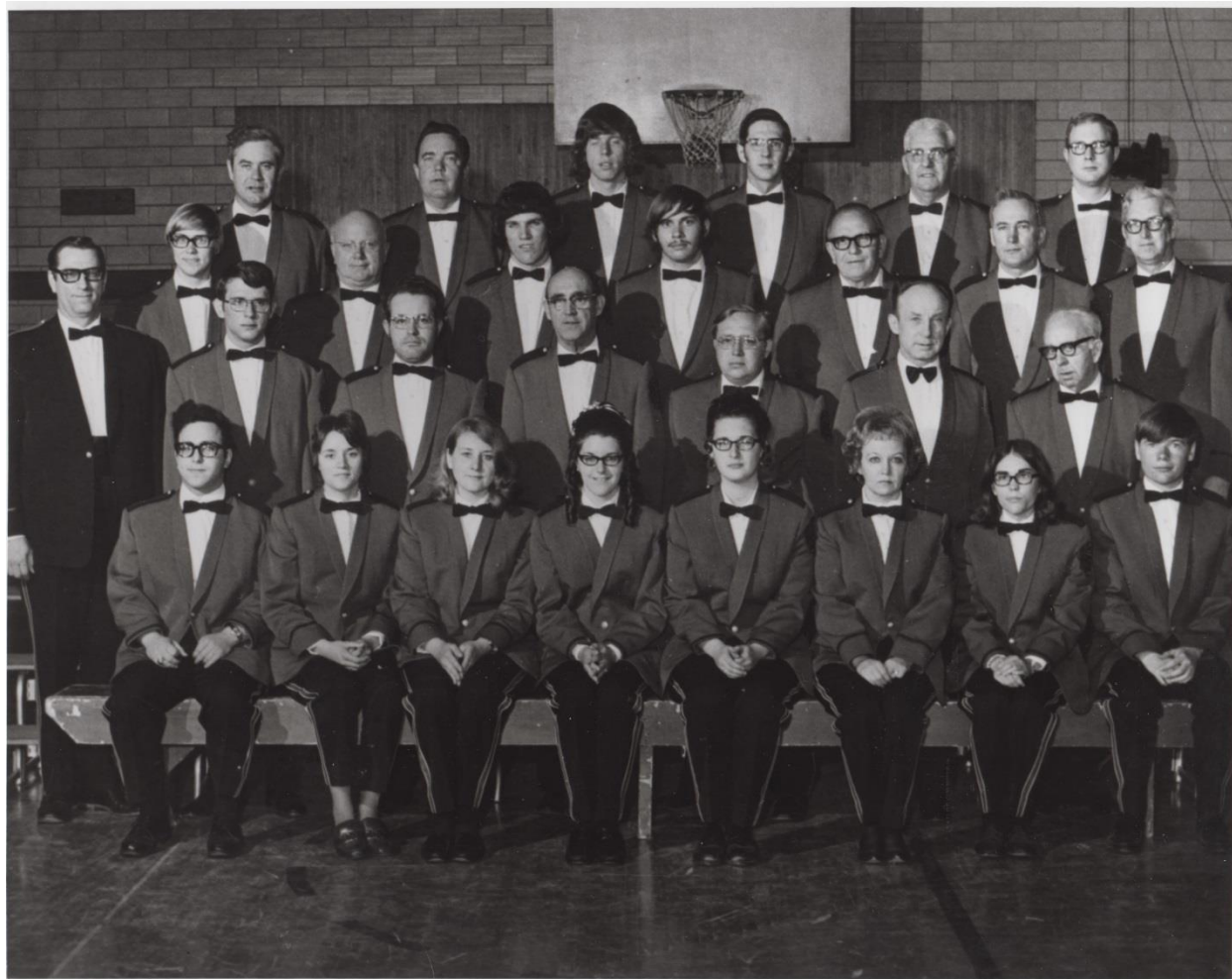
City Band – Bay de Noc Community College Graduation