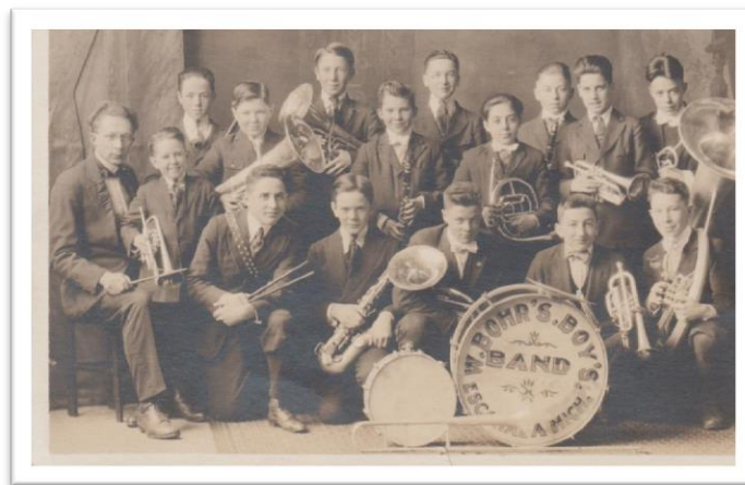
Early Boys Band

Some of the area's earliest bands included the Boys Band, the Escanaba Military Band, the Gladstone City Band, the Kiwanis Band, and many others.