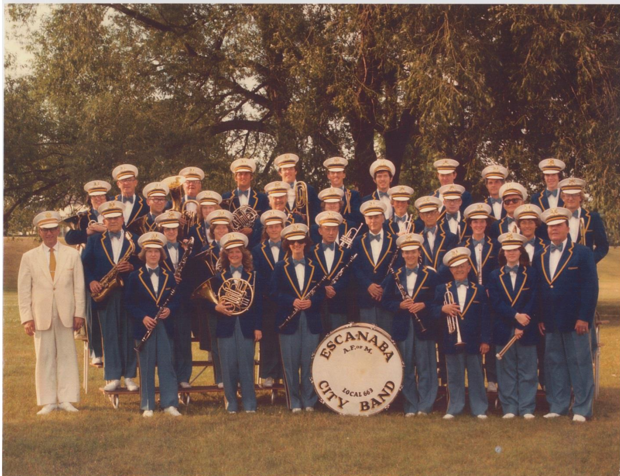
City Band – 1978