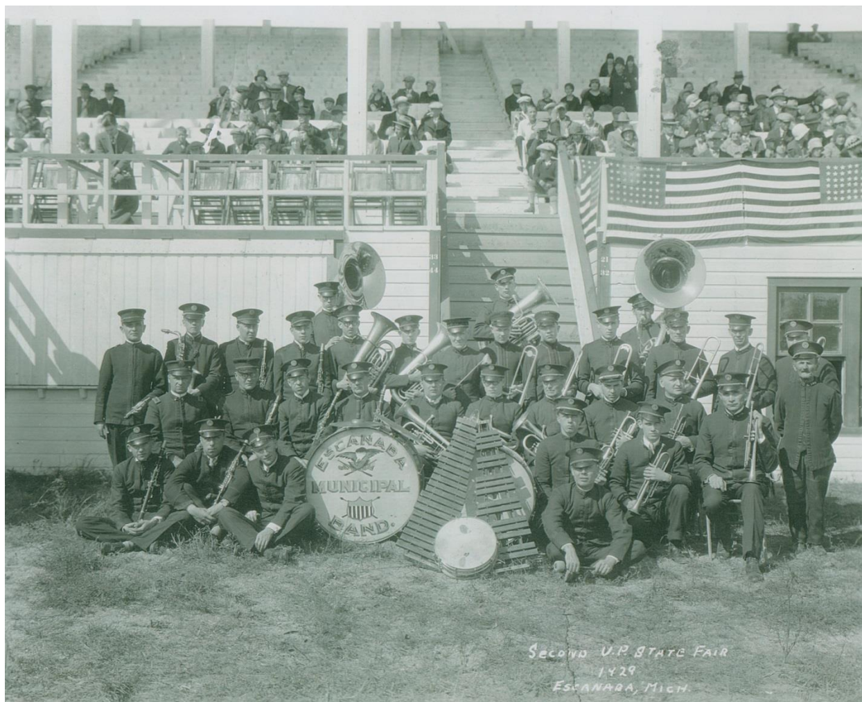
SECOND V.P. STATE FAIR 1929 ESCANABA, MICH.