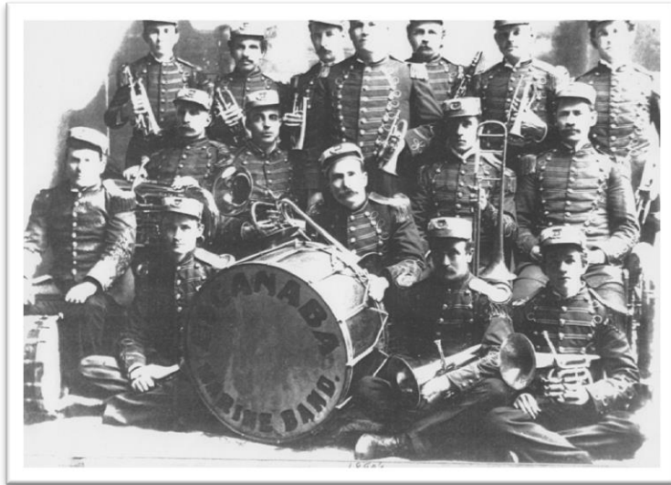
Escanaba Marine Band 1890's