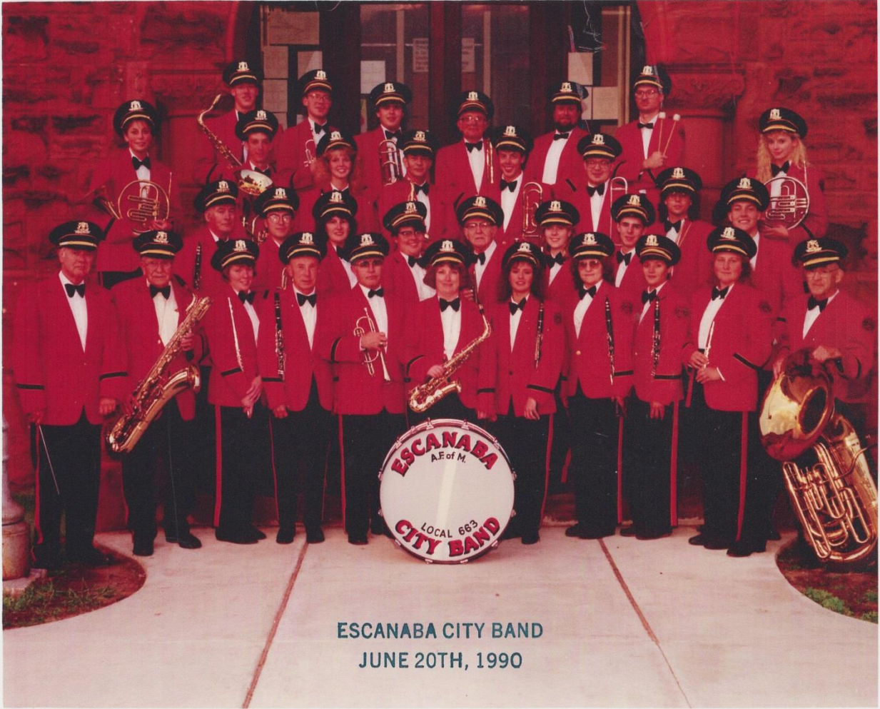
ESCANABA CITY BAND JUNE 20TH, 1990