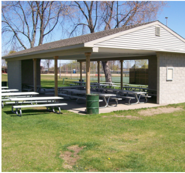
Ludington Park Pavillion

Located near the south end of Ludington Park, the pavillion has ample 110-volt electric service, potable water, and a large capacity BBQ grill. Included are 10 eight- person picnic tables with ample green space surrounding.