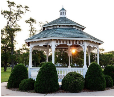
Ludington Park Gazebo

1/2 day fee of $75 resident and $100 non-resident. Full day fee of $100 resident and $125 non-resident .