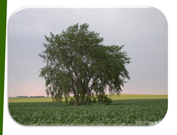
Síberían Elm (Ulmus Pumíla)